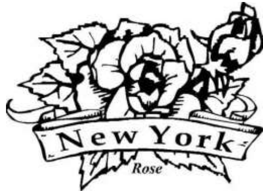
New York State Flower: Rose