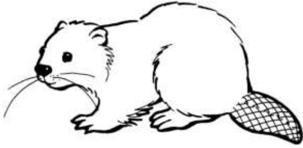
New York State Animal: Beaver