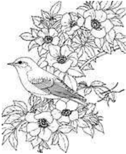
New York State Bird: Eastern Bluebird