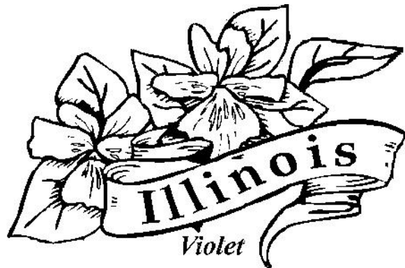
Illinois State Flower: Violet