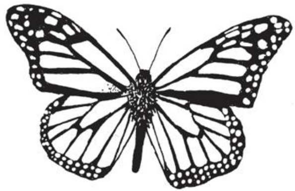
Illinois State Insect: Monarch Butterfly