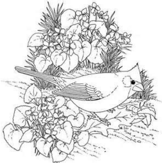
Illinois State Bird: Northern Cardinal