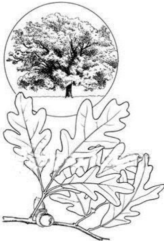
Illinois State Tree: White Oak