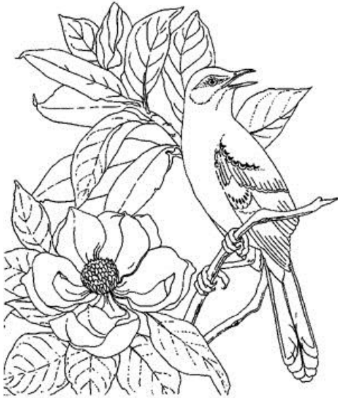
Mississippi State Bird: Mockingbird