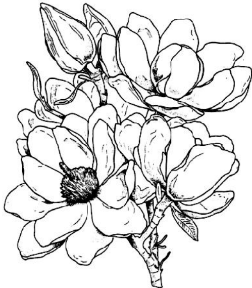
Mississippi State Tree: Magnolia Tree