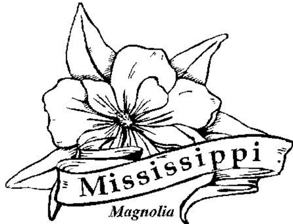
Mississippi State Flower: Magnolia