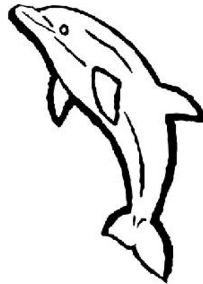
Mississippi Water Mammal: Bottlenose Dolphin