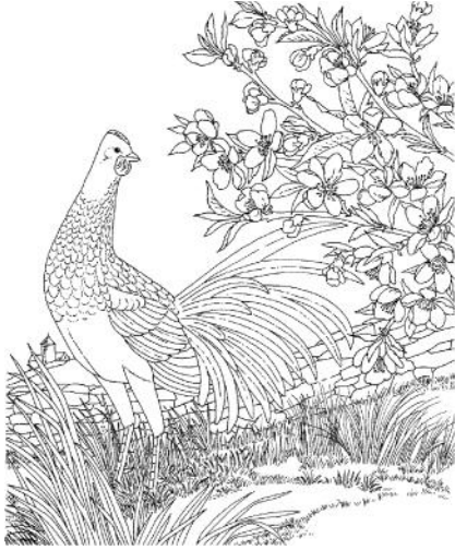
Delaware State Bird: Blue Hen Chicken