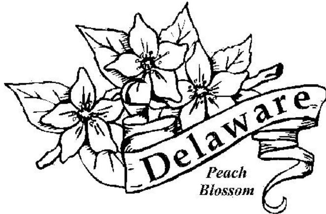
Delaware State Flower: Peach Blossom