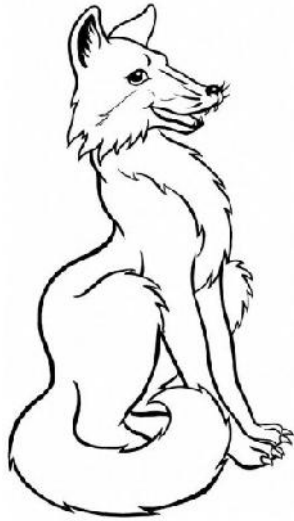
Delaware State Wildlife Animal: Grey Fox