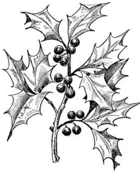
Delaware State Tree: American Holly